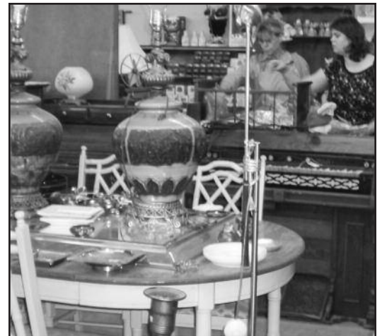
Thousands of shoppers bagged the best deals in the Permian Basin at the Texas-Size Garage Sale in November. The event generated more than $100,000 for Meals-on-Wheels.